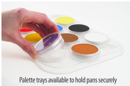
Palette trays available to hold pans securely