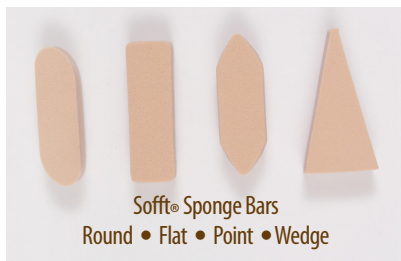
Softt® Sponge Bars Round • Flat • Point • Wedge

Flexible and non-abrasive Softt Sponges are great for applying color to hard to reach cracks & crevices.