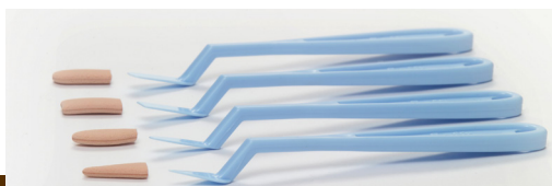
Softt® Knives & Sponge Covers available in 4 different shapes Round • Flat • Oval • Point

Softt Tools - a new generation of applicators made from our specially formulated micropore sponge for applying PanPastel. They are versatile, re-usable & easy to clean.